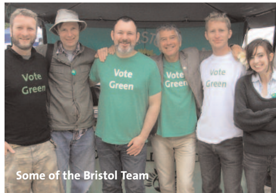
Some of the Bristol Team

which apart from being a remarkable and beautifully visual departure from 'politics as usual', raised a silly amount of money